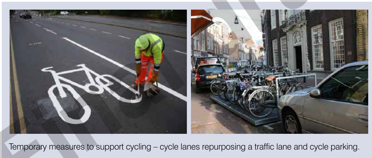
Temporary measures to support cycling – cycle lanes repurposing a traffic lane and cycle parking.

The Southampton Cycle Network will be rapidly advanced in line with the plans in our Transforming Cities Fund programme. This will utilise a range of existing measures and tools that can be implemented quickly, including 'pop-up' cycle lanes, temporary road closures to traffic, bus lanes, modal filters, and reallocating road space to create more space for cycling in narrow streets. These will be on the key corridors into Southampton, on routes to Southampton General Hospital, and along routes where people cycle for leisure. At the start and end of people's journeys we are proposing additional secure and temporary cycle parking. Modal filters, such as temporary planters, will help discourage through traffic from using residential streets whilst providing attractive and improved access to people walking and cycling in neighbourhood areas.