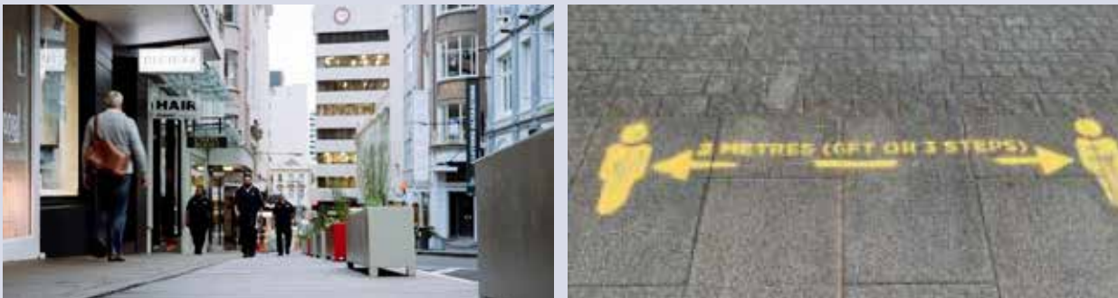
Using temporary flooring and planters to create more walking space by suspending parking in busy retail areas. Temporary stencil markings on the ground to highlight the social distancing message.

This is centred around providing more space, so people are able to adhere to social distancing guidelines. As more people go to work, shops and out for leisure managing the demand will be vital. This covers how retail and businesses get people safely in and out of their premises, how and when people get to work, and working with the bus operators on how to manage access and risks on public transport.