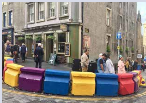
Temporary measures to support walking –repurposing a traffic lane for additional walking space and queueing.

We will be working with schools to enable pupils and staff to get to school actively and supporting social distancing. We already have a successful School Streets programme and toolkit, and we will work with schools to facilitate local road closures or other measures that can create extra space at the school gates. These combine timed road closures with parking reallocation or additional temporary footway widening.