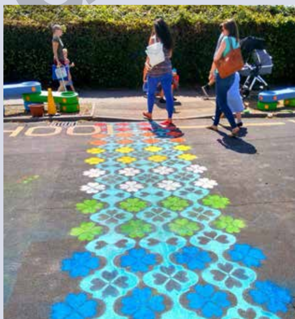
Temporary measures at schools to create more space at school entrances and timed road closures for pick up and drop off.