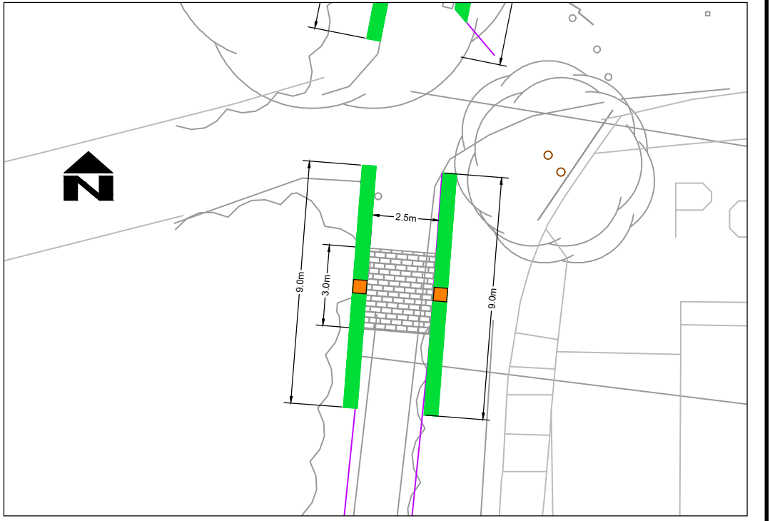
Inset F 1:100 scale