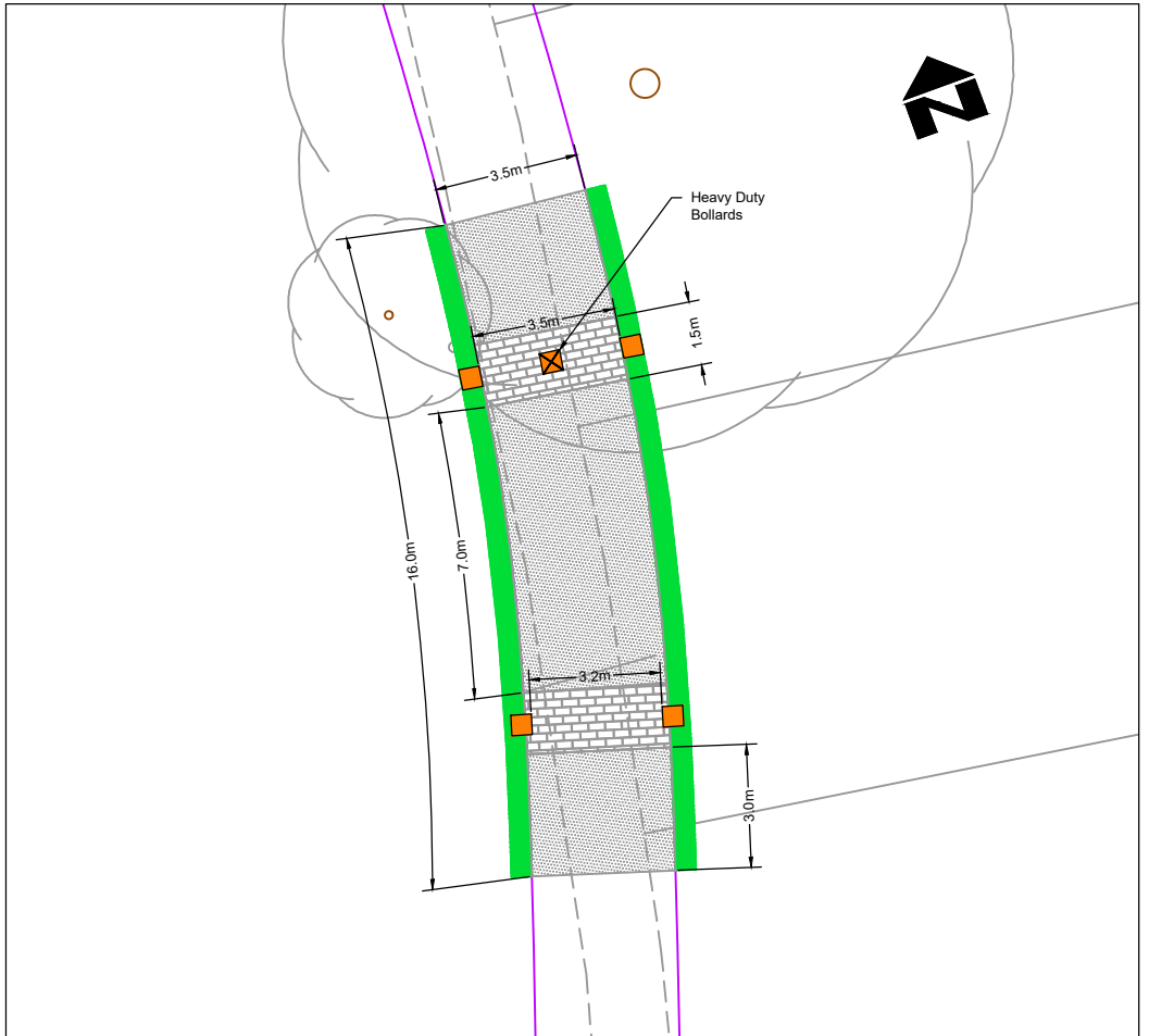
Inset B 1:100 scale